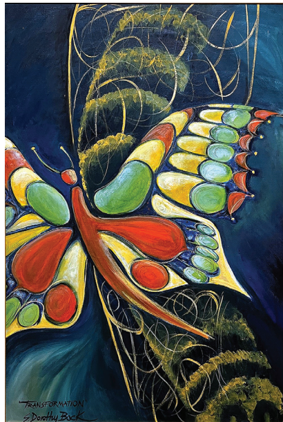
Transformation , Sister Dorothy Bock