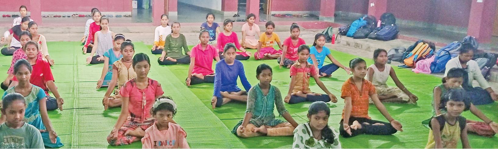
Students staying at Maria Sadan Hostel take part in a meditation exercise.