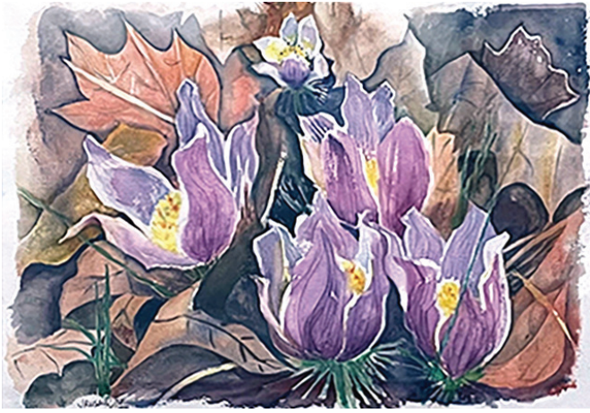
Purple Flowers , Sister Jane Elyse Russell