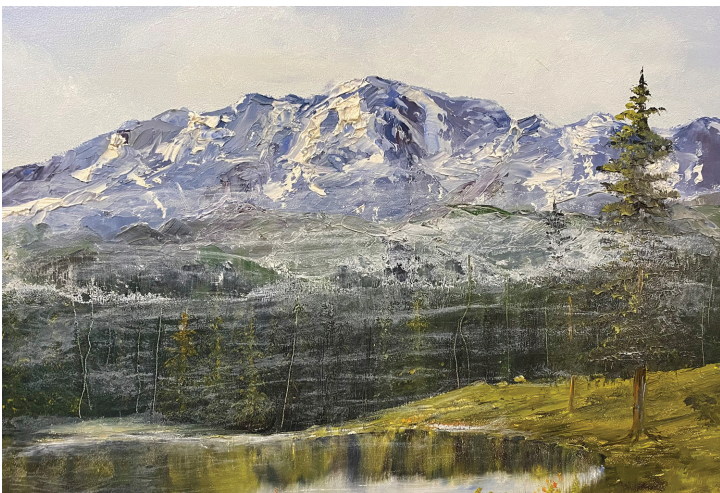
Mountain Landscape , Sister Gloria Fewes