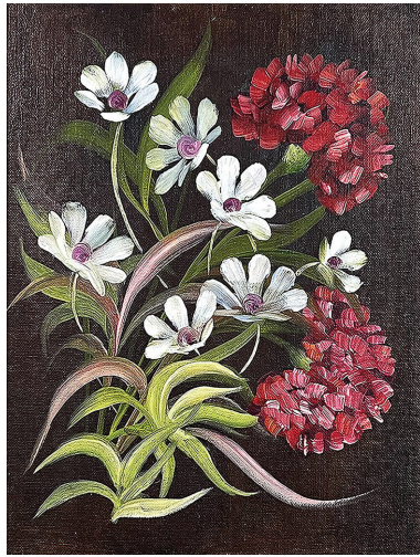
White Daisies and Red Hydrangea, Sister Gwen Floryance